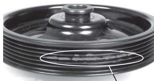
Road Debris Damage