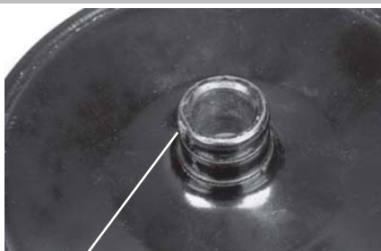
Bent or Flat Shaft