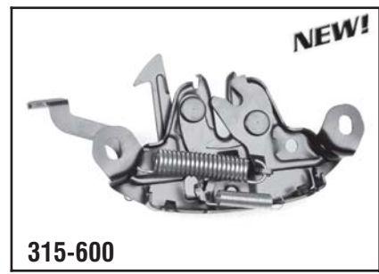
315-600 Hood Nissan Altima 2001-98