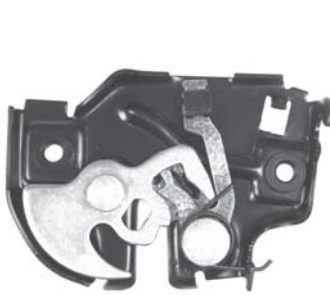
315-100 Hood Latch GM 2005-82