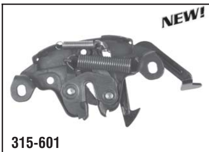
315-601 Hood Nissan Maxima 1999-95