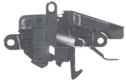
315-401 Hood Latch Toyota 1997-93