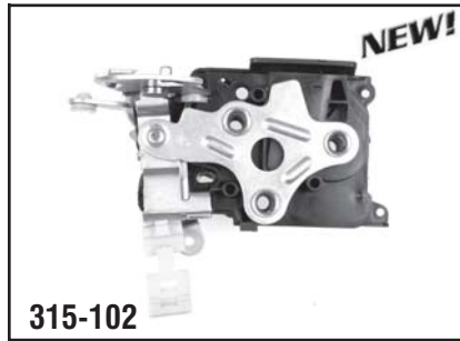
315-102 Door GM Various Models 2005-93, Left