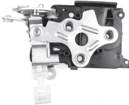
315-102 Door Latch GM 2005-93