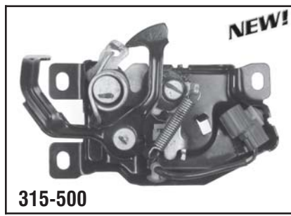
315-500 Hood Honda Accord 2002-98