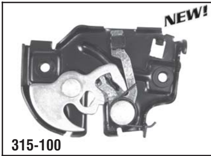
315-100 Hood GM Various Models 2005-82