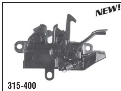
315-400 Hood Toyota Camry 2001-97