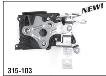
315-103 Door GM Various Models 2003-93, Right