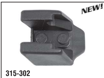
315-302 Hood Jeep Wrangler 2004-97