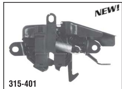
315-401 Hood Toyota Corolla 1997-93