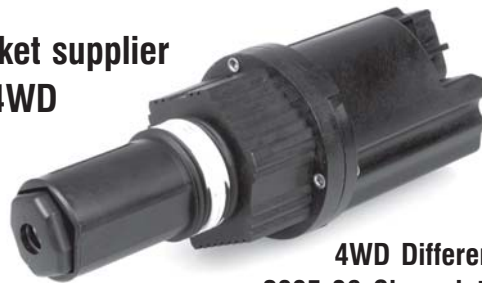
600-101 4WD Differential Actuator 2005-96 Chevrolet/GMC Trucks

Dorman is the only aftermarket supplier offering a complete line of 4WD actuators and NEW non-remanufactured transfer case motors.