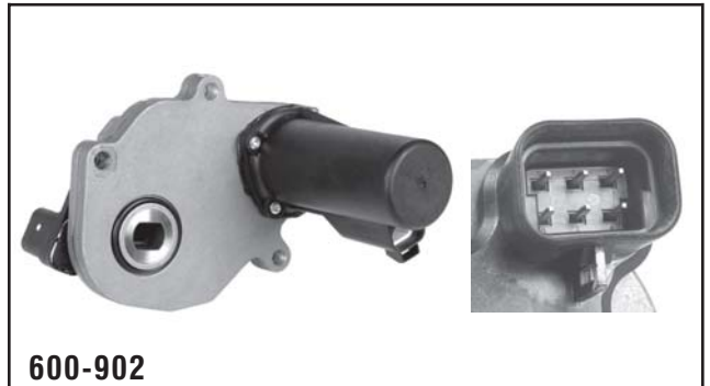
600-902 Transfer Case Motor 2000-96 K2500 Pickups, 1999-96 K1500 Pickups/Suburban/Tahoe, 2002-01 Dakota/Durango, 1999 Escalade Fits New Process 243 w/RPO Code NP1 Rectangular Plug w/2Pins & Rect. Plug w/6 Pins