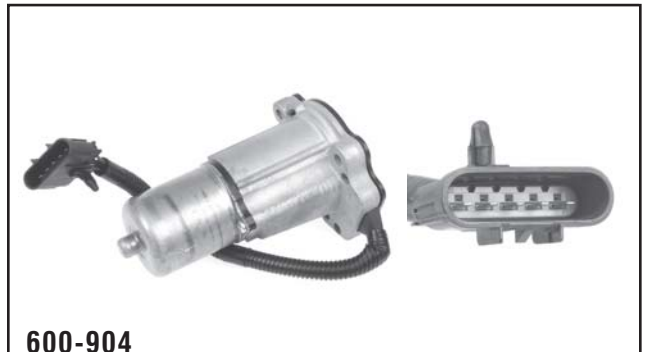
600-904 Transfer Case Motor 2006-04 Buick Rainier, 2004-02 Oldsmobile Bravada Fits New Process 126 w/RPO Code NP4 Oval Plug w/5 Pins