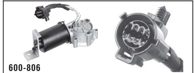
600-806 Transfer Case Motor 2003 Expedition/Navigator Fits Borg Warner 4416 Transfer Case Round Plug w/7 Pins