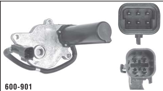
600-901 Transfer Case Motor 2005-99 S10 Blazer/Pickups/ S15 Sonoma, 2002-98 Suburban/Tahoe/Yukon, 2002-99 Sierra/Silverado/Escalade, 1999-98 K1500/K2500 Pickups, 2001-99 Bravada/Jimmy Fits NVG 136/236/246 w/RPO Code NP8 Square Plug w/4 Pins & Rectangular Plug w/6 Pins