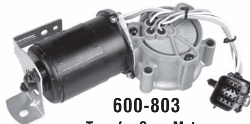
600-803 Transfer Case Motor 2001-96 Ford Explorer/Mercury Mountaineer