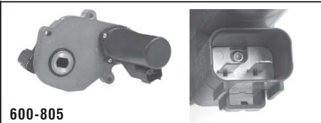
600-805 Transfer Case Motor 2005-00 Excursion, 2006-99 Super Duty Trucks Fits New Venture Gear 273 Transfer Case Rectangular Plug w/2 Pins & Square Plug w/6 Pins