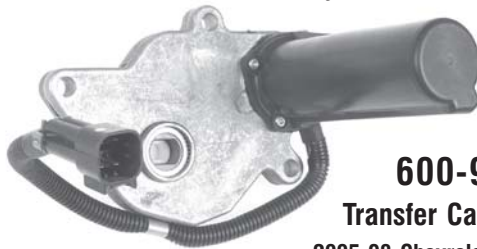
600-901 Transfer Case Motor 2005-98 Chevrolet/GMC Trucks