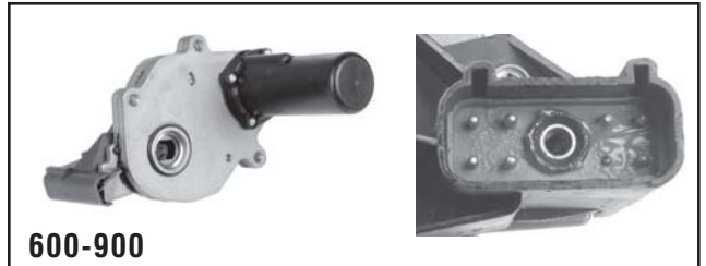
600-900 Transfer Case Motor 2005-92 S10 Blazer/Pickups/S15 Sonoma, 2001-92 S15 Jimmy/Bravada, 1993-92 Typhoon, 2000-98 Isuzu Hombre Fits NVG 233 w/RPO Code NP1 Rectangular Plug w/7 Pins