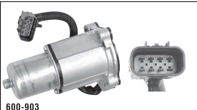
600-903 Transfer Case Motor 2006-02 Trail Blazer/Envoy, 2006-03 Isuzu Ascender Fits New Process 226 w/RPO Code NP8 Rectangular Plug w/7 Pins