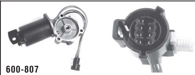
600-807 Transfer Case Motor 2005-02 Explorer Sport Trac, 2003-00 Ranger, 2003-95 Mazda Pickups Fits Borg Warner 1354 Transfer Case Round Plug w/7 Pins