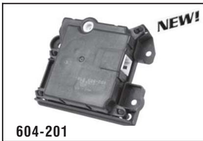
Ford Explorer, Ranger w/Automatic A/C Control 2003-98.