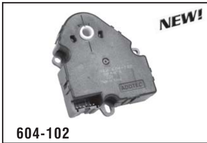
GM SUVs and C/K-Series Trucks 2002-88.