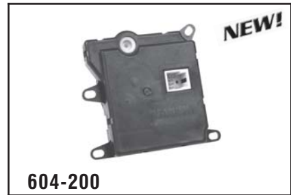
Ford E-Series Vans, Windstar 2004-96.