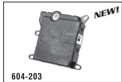
Ford Windstar 2003-99.