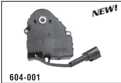
Jeep Grand Cherokee 2004-99.