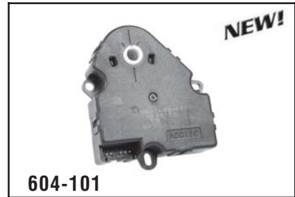
GM SUVs and C/K-Series Trucks 2002-99.