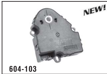
GM SUVs and C/K-Series Trucks 2002-91.