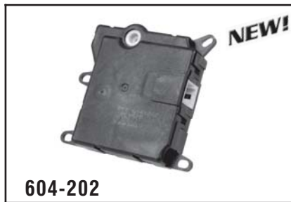
Ford Explorer, Ranger w/Manual A/C Control 2006-98.