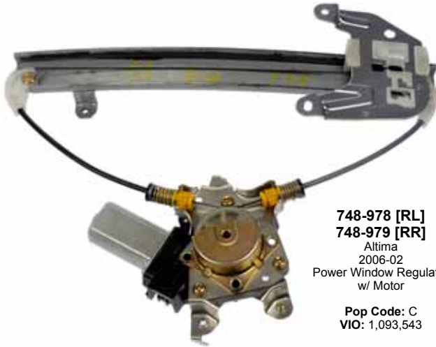
748-978 [RL] 748-979 [RR] Altima 2006-02 Power Window Regulator w/ Motor

MOST COMPREHENSIVE PROGRAM IN THE AFTERMARKET